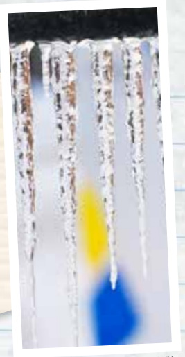
FLICKR USER SHEENAPHOTOGRAPHY

In cold winter weather, icicles often form on the eaves of houses. Why? When snow on a rooftop melts from the sun or warmth inside the house, water trickles down to the eaves. If the air is cold enough, the water drops freeze before they fall, forming icicles that grow longer as more water trickles down. Here's a chance to take a closer look at icicles and how they grow.