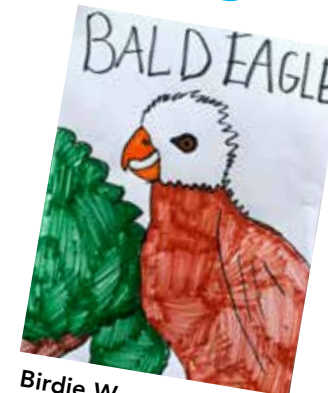
Birdie W., age 7