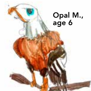
Opal M., age 6